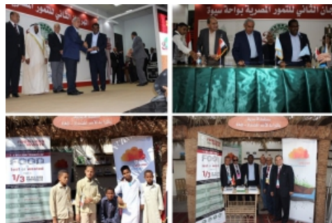
@fao_rne Group of photos from the event

Siwa, 28 October 2016: Food and Agriculture Organization of the United Nation (FAO) awarded the Dates Production Sector in Siwa Oasis, the Globally Important Agricultural Heritage Systems (GIAHS) Certificate which makes the Oasis a globally important agricultural heritage system because it preserved the environmental and heritage ecosystem in the cultivation of Dates.